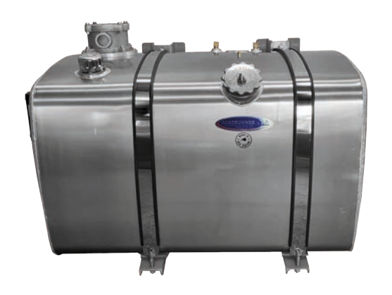
Oval Square Combination tank with pick up pipes grey brackets and stainless steel straps.