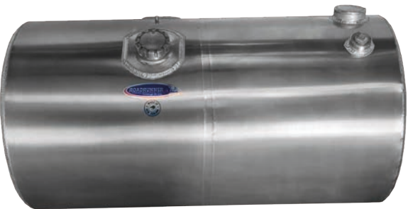
Customised Combination Tanks.