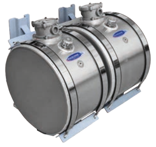
120L and 140L Round Hydraulic Tanks.