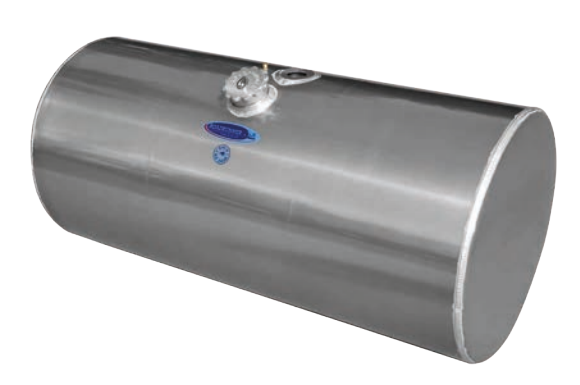
Round Fuel Tank without brackets or straps.