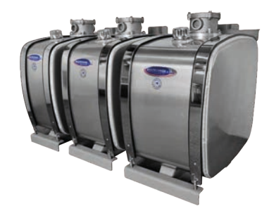
120L, 140L and 160L Oval Square Hydraulic Tanks.