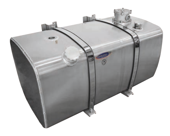
Oval Square Combination Tank with VDO, grey brackets and stainless steel straps.