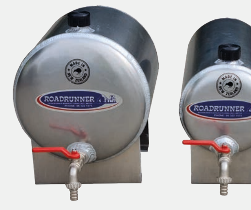
WT-02 & WT-01 Water Tanks.

Get a quote or place order: www.roadrunnerltd.co.nz /shop/water-tanks