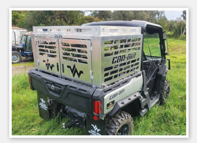
A selection of some of our custom designed dog boxes.

Multi-purpose: Dog boxes can be multi-purpose. Many standard off-the-shelf options cannot be tailored to exactly what you need from them. Roadrunner's dog boxes can also be used for storage and can be fitted and designed with flexibility in mind.