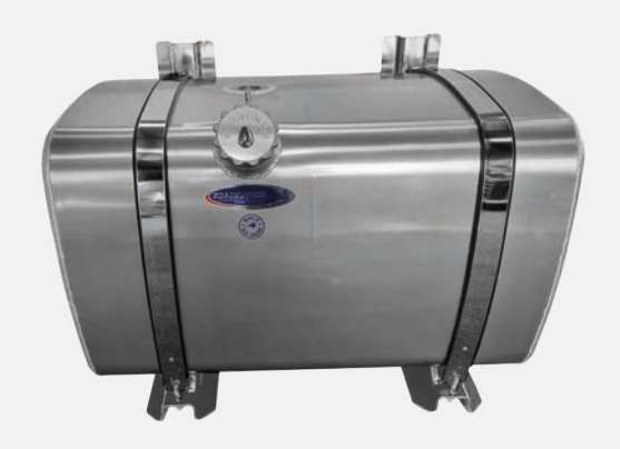
Oval Square Fuel Tank with grey brackets and stainless steel straps.

Thicker aluminium: Thicker grade aluminium means a stronger, more durable product that is less likely to dent/scuff or damage.