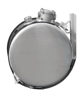
Round Hydraulic Tanks with single mount brackets and stainless steel straps.