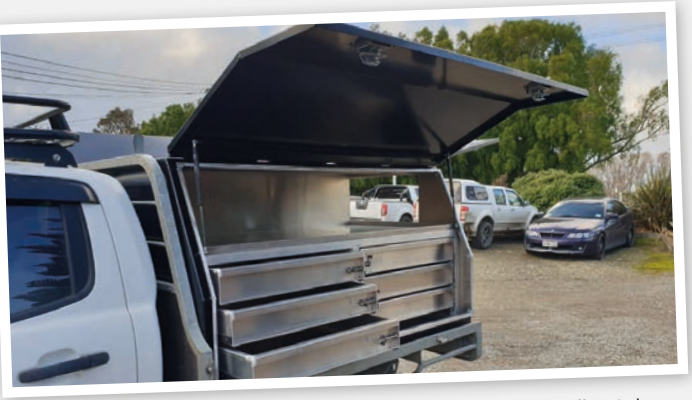
Service Box with pull out draws.

Get a quote or place order: www.roadrunnerltd.co.nz /custom-manufacturing/ute-boxes