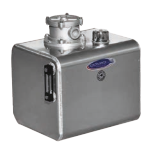
Custom Hydraulic Tank with sight glass.