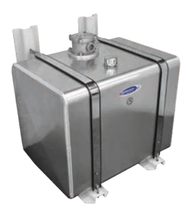
Custom 300L Hydraulic Tank with two brackets.