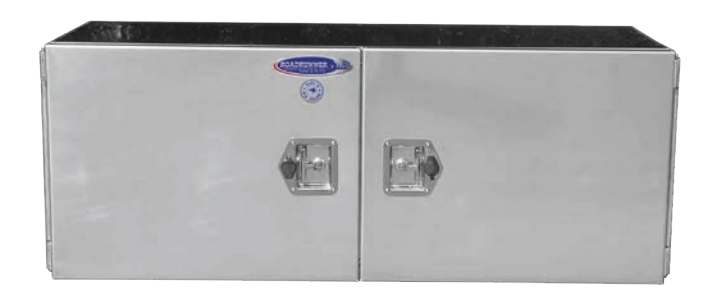
Double Door Toolbox.