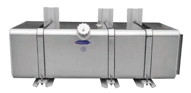
Square Fuel Tank with primed brackets and stainless steel straps.