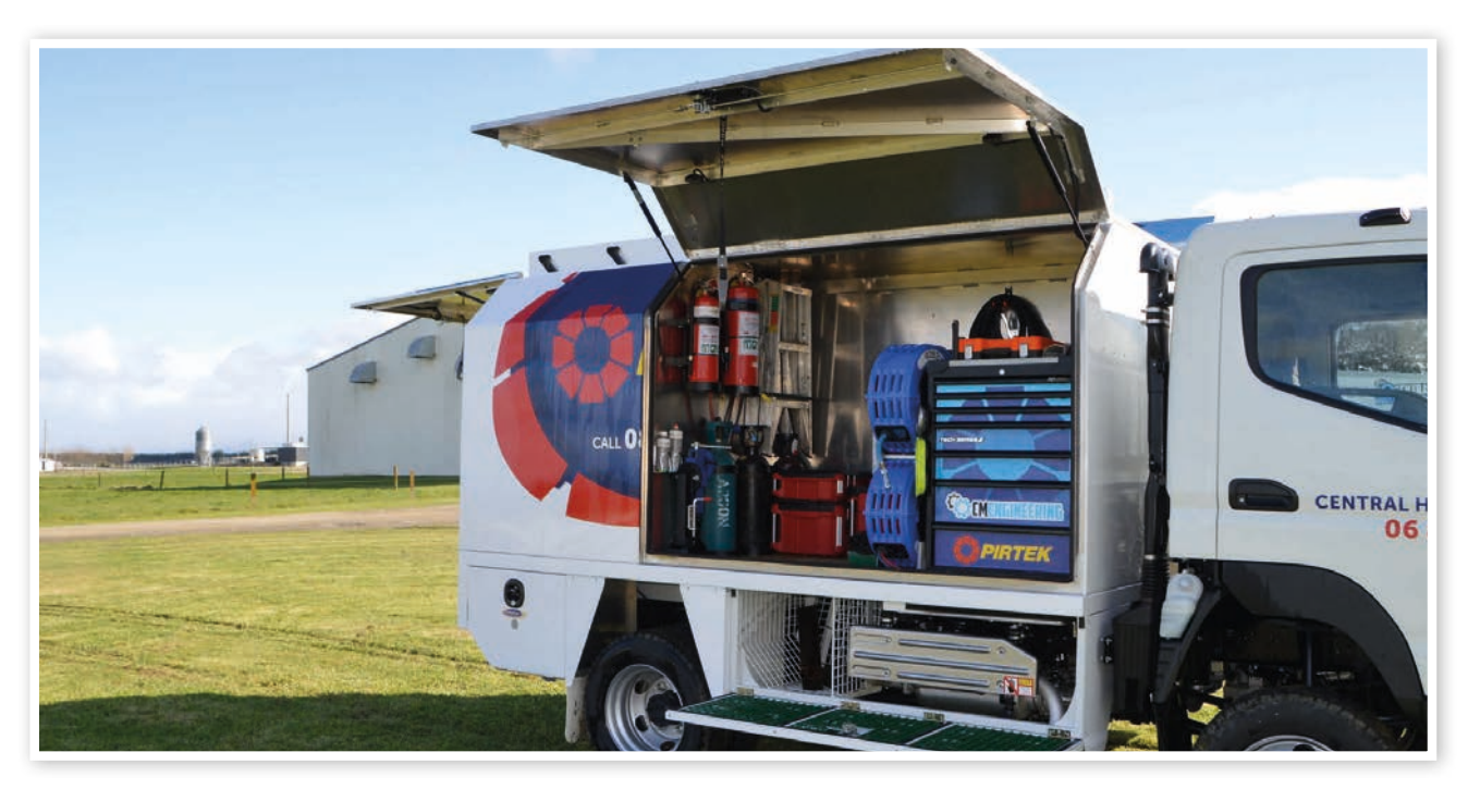
The finished MSU truck showcasing its large storage capacity for the team's parts and tools required on a job.

The completion of the MSU truck project has had a significant positive impact on Pirtek CHB's operations. The newly designed 4WD truck with its custom-built body has enabled the company to cover a larger land area efficiently. The storage capacity, equipped with strategically placed compartments and toolboxes, has ensured that the team had all the necessary parts and tools readily available. This has not only improved service response times but also projected a professional image of the company whilst out on jobs.