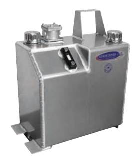
Custom Hydrualic Tank.