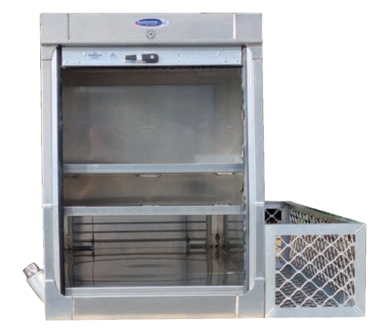
Double roller door locker box with hidden water tank and dunnage cage.