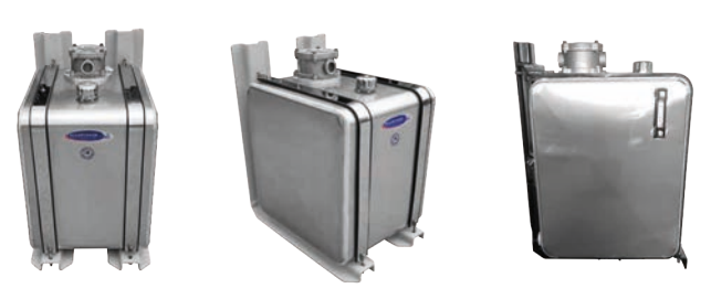
Square Hydraulic Tanks with single mount brackets and stainless steel straps.