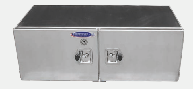
Double Door Toolbox.

Value-add: Choosing a robust, durable, New Zealand made product might enable you to hold on price for longer in terms of vehicle value or add to the sale value or sale leverage down the line.