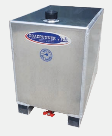
Customised Water Tank.